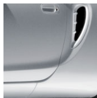
Silver Streak Mica with Gray or Black fabric or Black leather interior